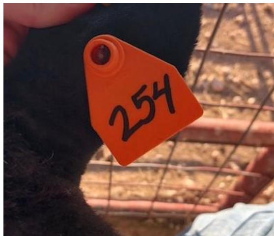
Flock Tag – matches registration papers

It is unlawful to remove USDA scrapie tags. DO NOT REMOVE SCRAPIE TAGS! The committee should not remove tags.