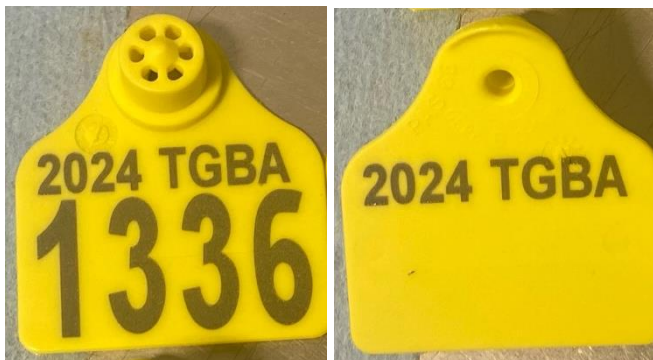
Tag colors change every year.