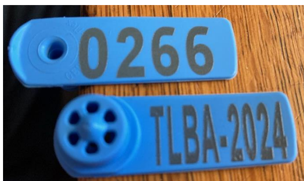
Tag colors change every year.