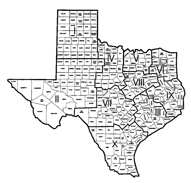
Texas FFA Area Association Map: Texas FFA is divided into ten administrative areas which are broken along county lines and described in the Texas FFA bylaws.

provisions of these policies and governance over state association operations.