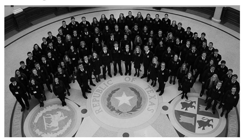
The 2016 State Leadership Conference was held at the State Capitol in Austin, June 4-7, 2016

Leadership Conferences Learning doesn't stop when schools close for the summer months. Thousands of Texas FFA members attend chapter, district, area and state leadership conferences held across the state each year. The Texas FFA Association's approach to leadership development is "learning by doing" through peer instruction. Each year, the state's 74 area officers attend the state leadership conference held in early June. State officers organize the conference and provide the instruction with the goal of equipping area officers to conduct area conferences for district and chapter officers. All of the state's ten areas and a number of districts conduct leadership conferences for chapter and/or district officers. Several districts hold chapter officer camps.