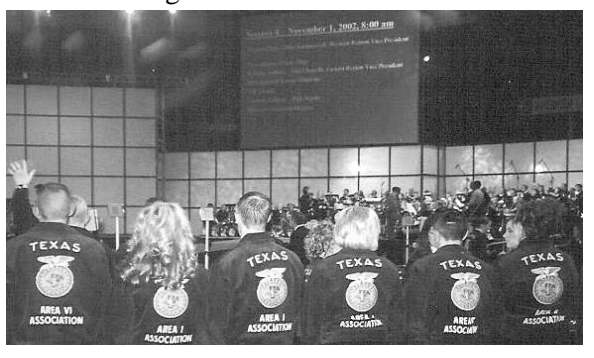
Texas FFA members have an opportunity to exert influence on a national scale, not only as delegates, but also via a grassroots process through which any member can have an submit an issue and possibly have it debated and discussed by national delegates.

delegate process starts long before the national convention. In Texas, It begins as a grassroots process through which any member has the opportunity to have an issue or idea considered at the national level. One of an area officer's first responsibilities is to gather concerns and issues regarding the National FFA Organization. These are funneled to the state leadership conference in June, at which time a student national issues committee examines all forwarded issues and submits a report to the Texas FFA Board of Directors and to the National FFA Organization. These issues, along with other issues forwarded by other states are considered by the delegates to the National State President's Conference in Washington, D.C. Issues deemed to be most