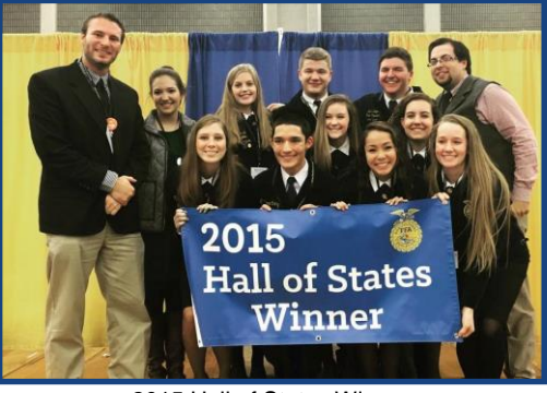
2015 Hall of States Winner: Taylor-Katy

Since 2006, Texas FFA has solicited chapter proposals from across the state and supported a display created by a local chapter. Hall of States team members attend the display throughout the convention, field questions from the public and from a panel of judges who evaluate the displays and select a winner.